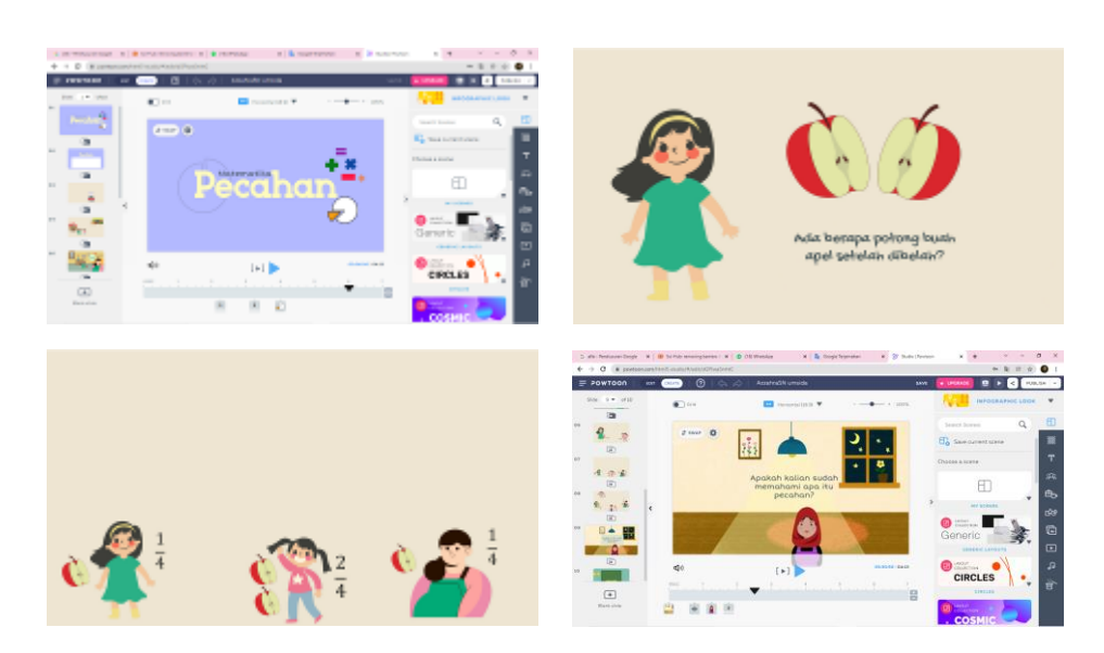
Figure 2. Constructivist-based PowToon Animation Multimedia (CoPAM)

The CoPAM validation in Table 5 shows that the CoPAM design is very valid. However, there are some suggestions for improvement by experts, namely the provision of a list of materials at the beginning of the CoPAM display, the selection of font sizes in CoPAM is enlarged, and the degradation of color selection in CoPAM should be softer or use pastel colors. Researchers followed up on the revision results by experts on the CoPAM design to get the final CoPAM design applied to research participants (see Figure 2).