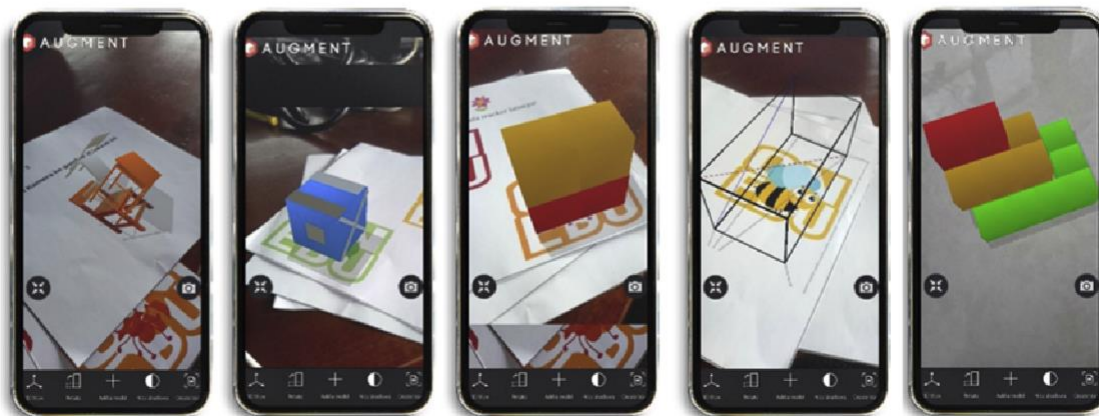
Figure 2. 3Dmetric display on each LT based on spatial activity: (1) representation, (2) visualization, (3) rotation, (4) reconstruction, (5) constructive space.

In each LT, 3Dmetric allows students to represent the back of a building; draw a space with provisions of rotation; determine the diagonal side and diagonal part of the space; and describe the top, side, and front views of an area. The results indicated that 3Dmetric provided a realistic medium for learning 3D objects while increasing students' spatial ability.