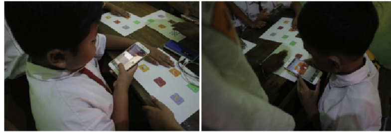
Figure 3. Students using 3Dmetric.