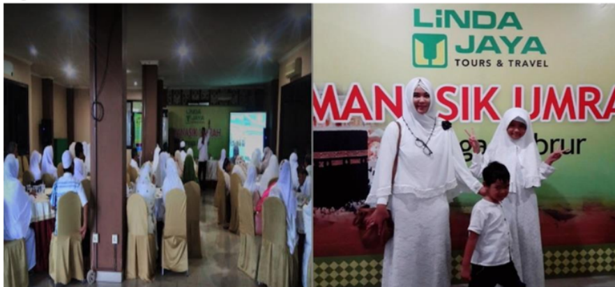
Figure 2. Manasik Umrah

Manasik Umrah is a preliminary simulation that contains the procedures for a series of activities in Umrah worship. During the implementation of Umrah rituals, the travel agency prepares a series of things to do ( fard' and sunnah ) using a miniature Kaaba before leaving for Saudi Arabia. For this reason, before performing actual Umrah worship, the Umrah congregation is required to follow the Umrah rituals in order to know what to do and what should not be done during the Umrah. As modernisation progresses, the Umrah rituals are not currently performed in an open field with the aim of providing a real picture of the area of performing Umrah. The committee uses luxury hotel facilities and audio-visual assistance as a medium to assist participants in the Umrah Manasik activities.