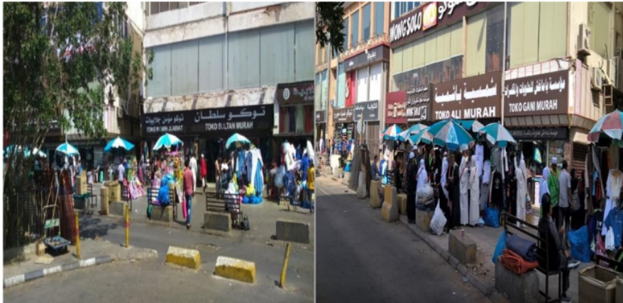
Figure 4. Shopping area

necessity for giving gifts, but have become symbols or symbols of hyperreality that must be met. For the mindset of the Umrah community, the higher the economic value of souvenirs bought and distributed, the more social values and reputation will increase.