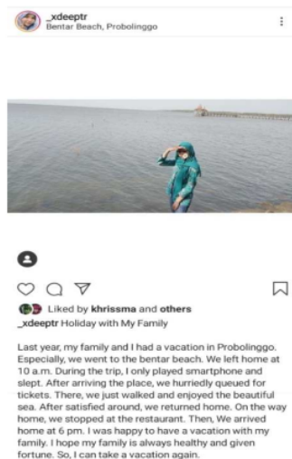
Figure 4. One of the students' recount texts in Instagram

mauliya.avivi Dea, please give title on your writing. Well, it still needs more sentences to make it better to read. Keep spirit.