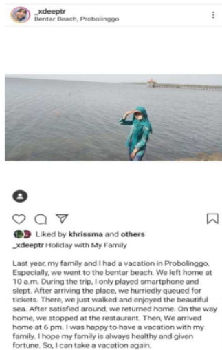
Figure 4. One of the students' recount texts in Instagram

mauliya.avivi Dea, please give title on your writing. Well, it still needs more sentences to make it better to read. Keep spirit.