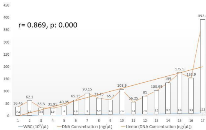
Figure 1. Correlation of Leukocyte Number with Genome Concentration in Type II Diabetes Mellitus samples

Diabetes mellitus is usually accompanied by severe infections. Diabetes mellitus induces immunity deficiency through several mechanisms. Increased sugar levels can cause disruption of the function of phagocytes of leukocyte cells that will accumulate in the site of inflammation. The higher the sugar level, the lower the number of leukocytes (Chodijah, Nugroho, & Pandelaki, 2013). Thus analysis needs to be related to molecular analysis especially for examination using blood samples. To find out the correlation between the number of leukocyte counts and the quality of DNA produced, 17 samples were used. The results of statistical analysis show the correlation between WBC counts and the quantity of DNA shows an r: 0.869 , p: 0.000 (Figure 1). It means, there is a significant correlation between of them. Huang et al., (2017) states that the correlation between WBC and DNA quality correlates 0.708. The use of diabetes samples with higher glucose assumption does not seem different with the quality of the genome produced.