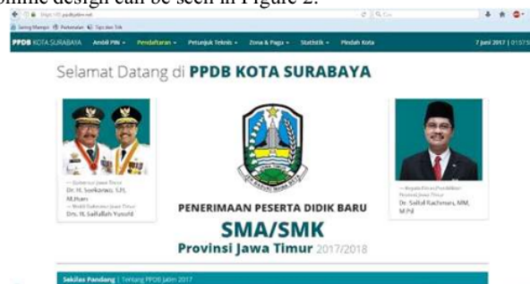
Figure 2. Website for the Acceptance of New Students in Surabaya, East Java 2018

E-scape is the appearance of a site starting from the colour used so that users feel comfortable and does not depend on the colours displayed and the design chosen to facilitate consumers in using the site. The application of PPDB online at East Java Provincial Education Office, Surabaya Branch displays colours and designs that are comfortable for users, making it easier to use. PPDB online users are interested in site colours and simple designs so that they are not boring when registering. Colour display and PPDB online design can be seen in Figure 2.