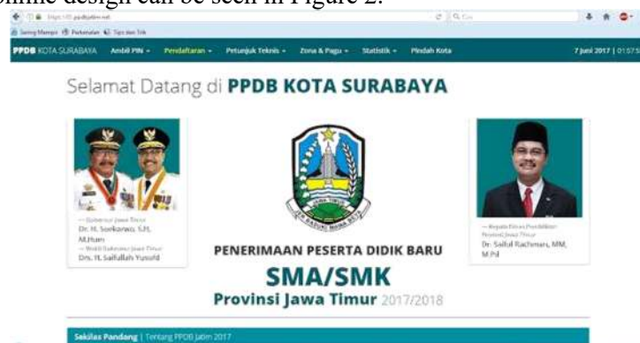
Figure 2. Website for the Acceptance of New Students in Surabaya, East Java 2018

E-scape is the appearance of a site starting from the colour used so that users feel comfortable and does not depend on the colours displayed and the design chosen to facilitate consumers in using the site. The application of PPDB online at East Java Provincial Education Office, Surabaya Branch displays colours and designs that are comfortable for users, making it easier to use. PPDB online users are interested in site colours and simple designs so that they are not boring when registering. Colour display and PPDB online design can be seen in Figure 2.