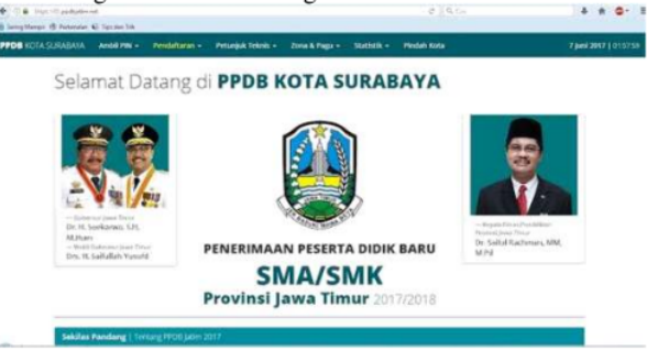
Figure 2. Website for the Acceptance of New Students in Surabava, East Java 2018

E-scape is the appearance of a site starting from the colour used so that users feel comfortable and does not depend on the colours displayed and the design chosen to facilitate consumers in using the site. The application of PPDB online at East Java Provincial Education Office, Surabaya Branch displays colours and designs that are comfortable for users, making it easier to use. PPDB online users are interested in site colours and simple designs so that they are not boring when registering. Colour display and PPDB online design can be seen in Figure 2.