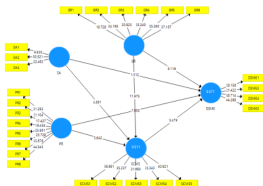
Figure 3. Structural model assessment