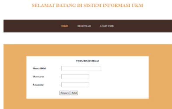
Figure 3 : Registration page

On the main page there is registration menu to register identity and login menu to enter the system SMI'S. Before entering the of system, the owner of SMI'S must register by filling in the name SMI's and username and password that will be used to enter the systems as shown in Figure 3.