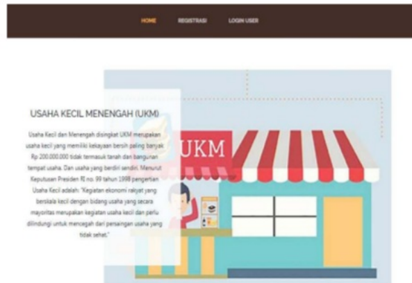
Figure 2 : Main page System SMI'S