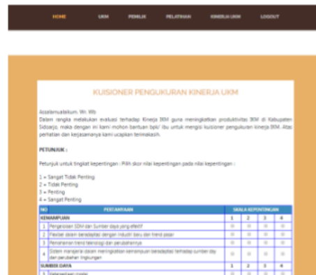
Figure 6 : SMI'S Performance Measurement

The user fills the questionnaire made by the local government by choosing 4 Likert Scales such as: 1) very important, 2) not important, 3) important and 4) very importantly. Once done, the user will save the questionnaire's response and the system will automatically display the quarantine result which is a graph of the result percentage. From these results can be found that there are variables that are important in running the business and doing measurements of its business performance so that it can help improve performance. Because good performance can improve the and by applying financial performance measurements can be used to determine the next strategy and plan of work.