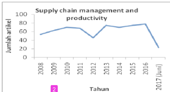
Fig. 2. The number of articles in the last 10 years

Based on the results of the study through a survey with an article data source that scopus index until June 2017, it is known that there are 1036 articles in the keyword "supply chain management and productivity" published in the range of 1979 to 2017 (June). The development of the number of articles in the last 10 years is as follows: