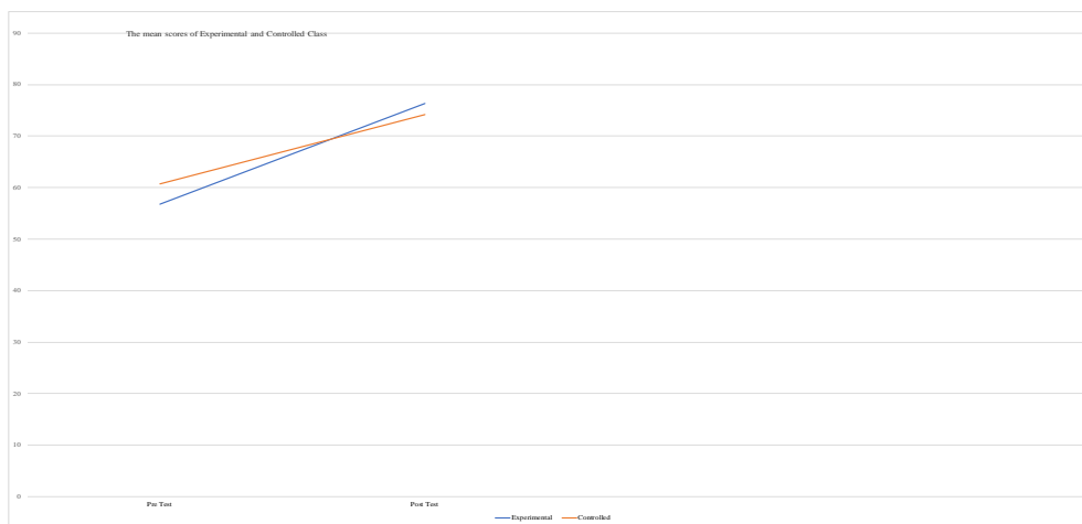
Figure 2: Mean of Pre Test and Post Test

It can be concluded that from the description above, the mean score of the post-test from the experiment class which were given the intervention had a higher score than the score from the controlled class which were not given any intervention. So this means that there is a significant effect on students' understanding when they use word webbing in writing of descriptive text.