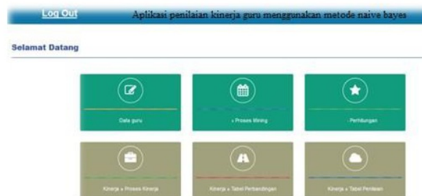
Figure 3. Homepage.

Figure 3 shows Homepage that contains the menus that will run on the data mining process from the teacher data input to the teacher performance feasibility calculation.