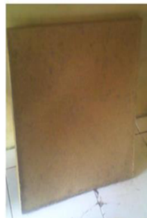
Figure 1(a). Composite particle board.

catalyst mekpo, (2) Sample B: 75% MGMW + 24% polyester resin + 1% catalyst mekpo, and (3) Sample C: 70% MGMW + 29% polyester resin + 1% catalyst mekpo. The first is drying the MGMW under the sunray for about two days and then it will be sieved by size 1.5 mm. The second step is the MGMW is dried again in the oven at temperature of 90°C for six hours. If the the MGMW is really dry (free from the humidity), it can be mixed with polyester resin and catalys, and poured into a mold length x width x height (40 x 40 x 1.5) cm and then is pressed by the hot press machine with pressure of 50 kg/cm 2 at 130 °C for 30 minutes. After it reversed and press again for ± 30 minutes at the same temperature. The results of hot press is composite particle board is shown in Figure 1(a) and further subdivided to form the sixth section ( Figure 1b ) on physical and mechanical testing on composite particle board according to the JIS standard A 5908-2003 [2] and Standar Nasional Indonesia (SNI) 03-2105-1996 [3] includes some tests, they (f 2 physical testing) are density and moisture content (number 5), internal bonding/IB (number 3), swelling in thick 1 ness after immersion in water, and strength of absorbtion water (number 4). Mechanical testing are modulus of elasticity/MOE (number 1), modulus of rupture/MOR (number 2), and strength of screw holding (number 6).