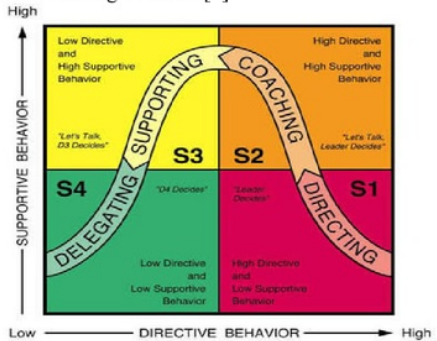
Fig. 1. Four basic leadership styles

How far a leader gets inivolved in one way communication, such as defining role, informing the followers about what is to be done, and monitoring the followers strictly. While supportive behavior is defined as how far a leader involved himself into two ways communication. Such as giving support, facilitating interaction, and involving the followers in making decision [9].