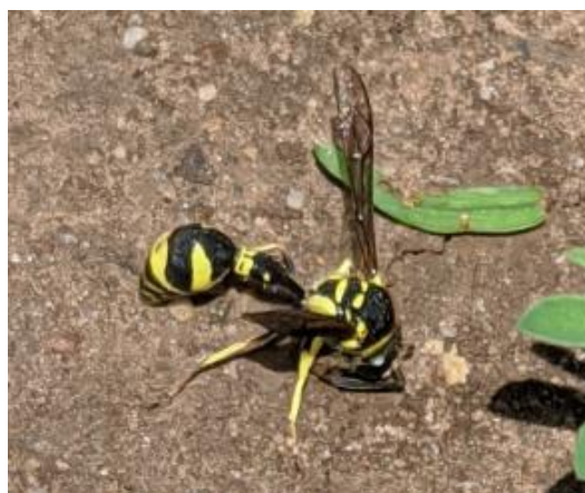
Figure 3. Eumenes mediterraneus wasp

The coloration of E. mediterraneus consists of black and yellow stripes, with dense hairs on the thorax. Its wings are smooth and have minimal venation, which is a characteristic of solitary wasps [2]. The body is black with yellow markings. The clypeus is mostly yellow, and there are two large spots on the scutellum. The tergite I has a wide yellow stripe on the upper part. Tergite II is distinguished by large yellow stripes on both sides and a transparent apical lamella. Tergites V and VI also have a yellow stripe on the upper part. Males have curled antennae at the tips. In females, the segment between the compound eyes is yellow, with black spots on the lower part.