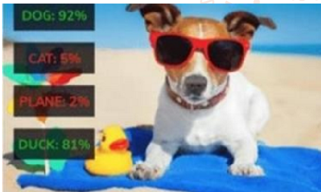
Fig 1: Objects for object recognition which consist a dog and a duck on the beach

The project goal is to incorporate an art of techniques for object detection to achieve high accuracy with realtime detecting performance. In this project, we use Python programming language with an TensorFlow-based solution for solving the problem of object detection in an end-to-end solving proposed system will be fast and efficient. A TensorFlow based application approach for an mobile device, using its built-in hardware component camera is used for detecting objects, more specifically: The framework is prepared in such a way where an mobile application (assuming you're using it on an Android/ios device) will capture real-time frames and will send them to the backend of the application where all the predefine computations takes place.