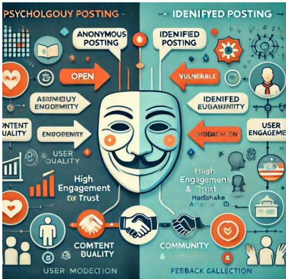
FIG.2 WEB DESIGN

The research will involve analyzing user behavior, collecting feedback, and making ongoing improvements based on how users interact with the platform. By blending anonymity with identity posting, Lumera seeks to strike a balance between free expression and community trust, which will ultimately shape the quality of engagement.