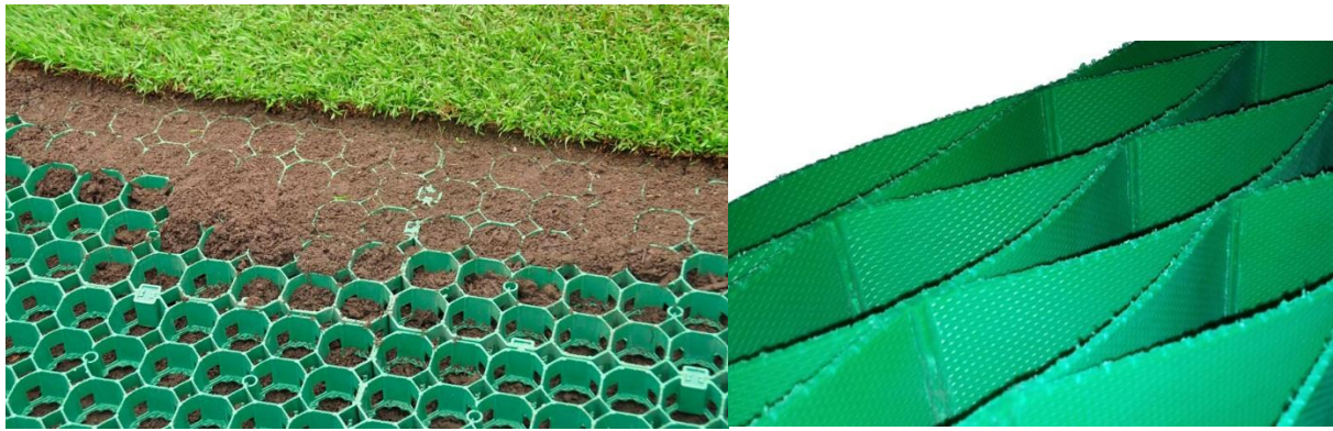
Figure 4. Frame polymer lawn gratings

The use of one or another type of grating to create eco-parking on the lawn is determined by the expected load, soil properties and aesthetic requirements for the territory [2].