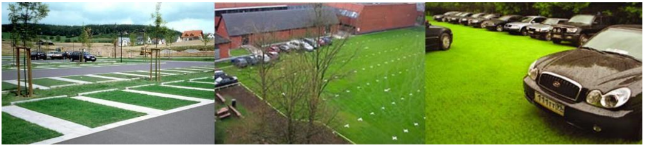
Figure 2. Eco-parking

Eco-parking is a part of the territory reinforced with a grass fence and a layer of fertile soil. It provides sufficient rigidity and wear resistance for passenger cars and light commercial vehicles. At the same time, the possibility of free germination of natural grass on the site remains. Eco-parking areas are divided into two types depending on what material the lawn grate is made of [3]: