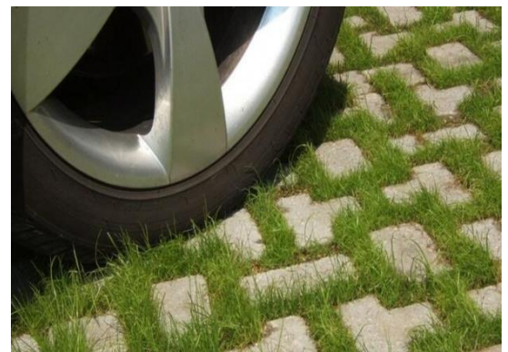
Figure 3. View of a car over a concrete lawn grate

Plastic. This type of eco-parking technology uses cellular block grids made of colored polyethylene (for example, ERFOLG Green Parking). The advantage of this coating is its low weight, inconspicuousness in overgrown grass, as well as the fastening of the modules into a single structure using latched locks. Although plastic gratings are less durable and wear-resistant than concrete gratings, they can withstand heavy foot traffic as well as the loads of cars and light trucks.