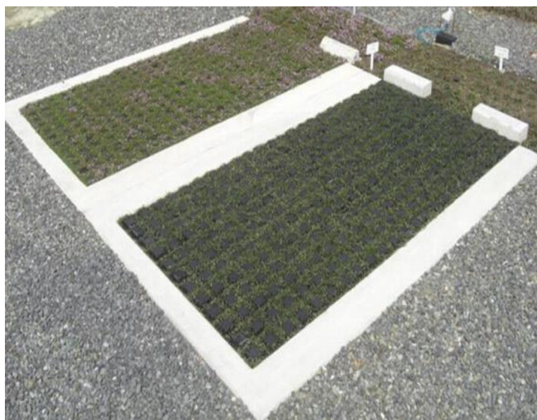
Figure 1. Top view of lawn grate

Additional materials include biomats and geogrids. To create an eco-parking, you need to understand its structure, because it uses a grid of polymer modules arranged in the form of cells. Before laying, it is necessary to prepare the base. To do this, the soil is dug up to a certain depth, then covered with crushed stone and sand, compacted well, and sometimes covered with geotextiles as a reinforcing and separating layer [5].