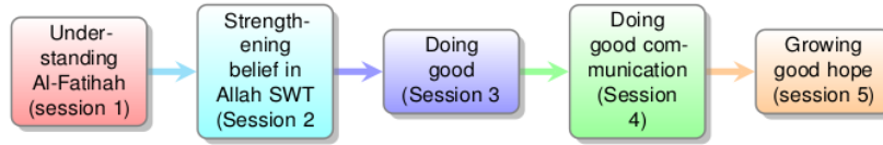
Figure 2. Counseling Stages based on Al-Fatihah Psychology.