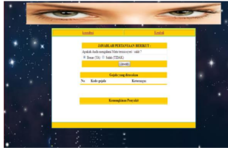
Figure 2a. User test results (the machine receives questions from users).

G_15 Blinding light, G_16 See the circle around the light, G_17 Objects that look yellowish, G_18 often replace glasses, G_19 double vision, G_03 Overblown eyes then the system defines cataract eye disease, and so on.