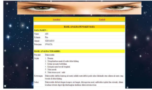
Figure 2b. User test results (how the decision engine is made).

In Figure 2a and Figure 2b is one example given in the study so that shows that the knowledge-based system functions as expected. One of the symptoms produced is first the patient's body has a fever, the patient's eyes ooze pus around the nose, then the tears come out excessively, the eyelids at the bottom experience swelling, the eyes are sore and red, so the system produces a diagnosis of "Dacryocystitis" with recommended given is treating patients by compressing warm water, nasal decongestants, topical and systemic antibiotics.