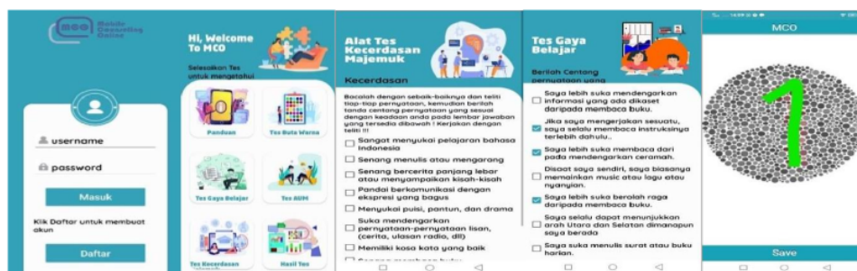
Figure 1. The innovation of online mobile counselling services (MCO)

MCO developed a variety of test tools that can help students understand their learning potential and help students develop and recognise effective learning strategies according to themselves. the novelty of MCO provides unlimited convenience and services with students using their respective smartphones. MCO have the quality of security, privacy and convenience that provide broad access and ease of use. In addition to loading some test tools and the results, MCO will be sent automatically to the user. MCO is also equipped with a room consultation feature with counsellors or psychologists that users can choose students. MCO prototypes that was developed to facilitate complete services for students with various features that make it easy for its users;