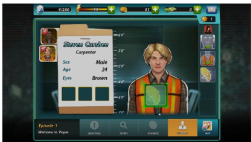
Figure 4. Final stage of deductive reasoning

In addition, there are several helpful features to help speed up our deductive reasoning, such as touching with long time brackets on the name of the object being searched for or a magnifying glass called hints like in the lower right corner. Also in figure 3, we can make students more understand about things in around.