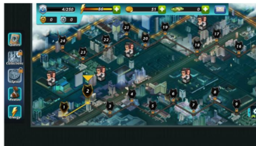
Figure 2. Map and detective account

The advantage of this game compared to others is because it can be played for free with certain conditions. The initial part of the mission requires full energy which is usually marked with a flash logo. One crime scene requires 15 energy to play, but sometimes there is a "discount" to 10 energy. But if you can collect all the stars, the energy drained is only 5 energies. Thus, the energy can be used in a series of problems or cases. Can take 5 minutes of energy charging time. Energy information can be seen in Figure 2.