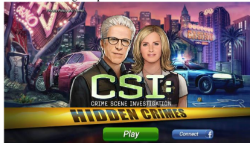
Figure 1. Front page layout of CSI:Hidden Crime

Figure 1 shows the initial layout of the CSI game; Hidden Crime , which is an adventure puzzle game with the aim of uncovering the puzzle of evil with forensic skills.