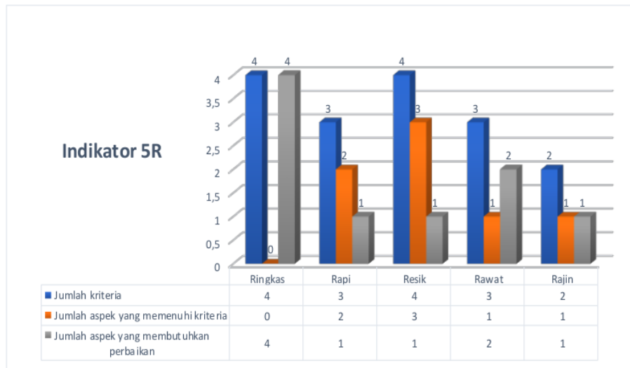
Figure 3. Chart Indikator 5S