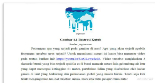
Figure 2. Video Links on Material

The module arranged to learn one basic competence, which developed into six meetings with a total face-to-face of 15 hours of learning. The eco-literacy module consists of 5 learning chapters covering temperature, expansion of solids, expansion of liquids and gas, change of temperature and ecosystem, and the cause and ways to prevent the change of environmental temperature integrated with the eco-literacy indicators. Every chapter contains materials and competence tests. Material given is in the form of the text of information summary equipped with pictures related to the material. Aside from that, sections of "Do You Know?" contain additional info regarding real events in daily life related to the taught material. Aside from material, the module was also equipped with a competence test. There are 6 competence tests arranged. Competence test is in the form of questions and observing activities that have to be done by the students. There are video links related to the material inserted, Do You Know, or the background in the competence test, as shown in Figures 2 and 3. These links are an upgrade from the module created aside from eco-literacy on chosen basic competence. The module was compiled in a PDF (Portable Document Format) document easily accessed and connected to the internet, so the video links inserted can be accessed (Figure 4).