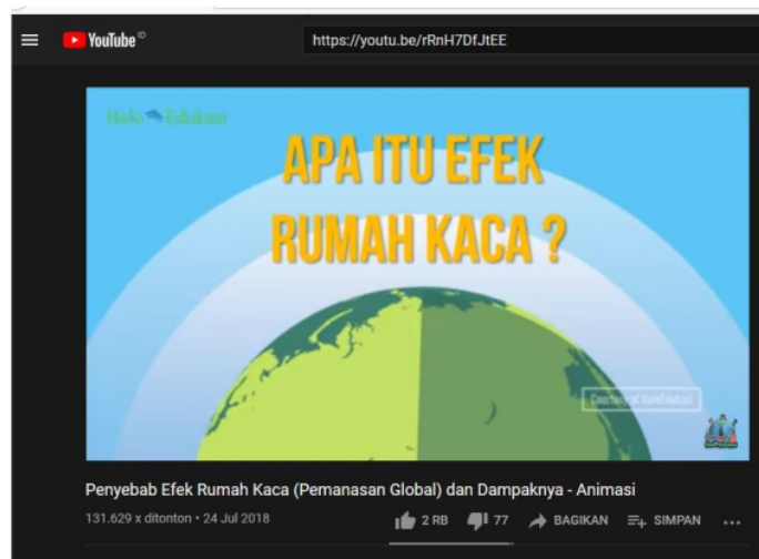
Figure 4. Video from Link

At the development stage, the module then go through a validation process to determine the validity and reliability. According to Almanasreh et al. (2019), validation was carried out to provide evidence of how much the instrument is appropriate and relevant for an assessment purpose. Reliability refers to measurements that provide consistent results and the same value (Mohajan, 2017). Two experts from external campuses carried the validation process, namely science practitioners at MTs 1 Jombang and campus internal lecturers. Module validation was done by using a validation questionnaire sheet. The validation questionnaire sheet contains the assessment criteria for the entire content of the module. There are five criteria in the validation questionnaire, including the feasibility of content, language, presentation, completeness of components, and physical form. This assessment criterion was supported by Munthe et al. (2019), which states that a feasibility analysis of content, language, presentation, and physical graphics can be used to determine the feasibility level of the developed module. This feasibility is characterized by high validity and reliability results so that the module can be used in a study (Dwianto et al., 2017). The following are the assessment criteria in the validation questionnaire, as shown in Table 3.