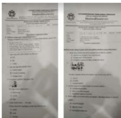
Figure. 3 Correcting Exam Questions

This activity invites 3 students to be involved in the school administration process and teachers, meaning that students help the administrative process. For example, students have supported teachers conduct student assessments, assisted teachers in preparing student portfolios, helped beautify classes, filing, and others.