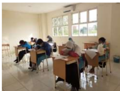
Figure. 1 Implementation of Teaching Assistants in Class

In this activity, students carry out teaching practices, starting on March 29 to June 25, 2021, preferably students from the PGSD study program because they have more capability in teaching. However, it is possible for students from other study programs to do the same thing. For example, students from the Guidance and Counseling Study Program, State University of Surabaya, also help teachers in the teaching and learning process. Students from other study programs carry out other activities, such as school administration, adapting technology or accompanying teachers in class.