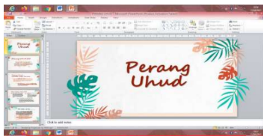
Figure. 2 Power Point Teaching Materials