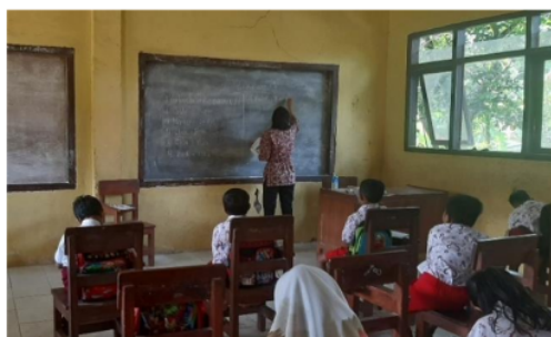
Fig.3 Teaching and learning English activity