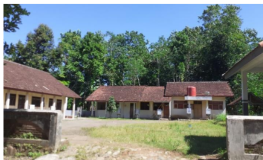
Fig. 1 The school's environment

Rural areas in Indonesia are synonymous with people who work as farmers, and these rural locations are filled with agricultural and plantation areas. as found in Silo District, Jember Regency, East Java Province. Even though it is on the island of Java, there are still rural areas, and they are classified as the 3T areas: Tertinggal , Terluar , and Terdepan (disadvantaged, outermost, and frontier areas). There are still many plantations to be found in the area, and the condition of schools in the area is still poor. One of them is Al Fatch Elementary School, which is in Karangharjo village, which is still in the Silo district area.