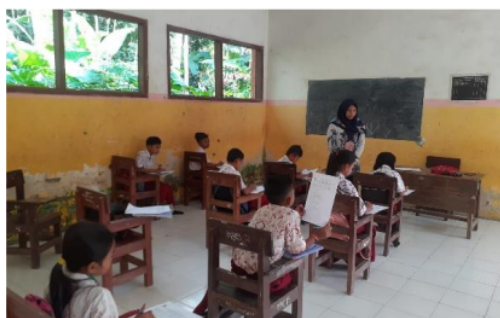
Fig. 2 Mossy classroom walls and peeling paint

The Al Fatch elementary school's location in a plantation area has an impact on the school's buildings and infrastructure. There are no lights in each class; only the teacher's room and bathroom have lights. The school is not a new school. However, this happened because the school was not managed by the local education office but was still managed by a foundation established by the school's owner's family. The infrastructure at the school is still lacking; one might even say it is inadequate, because there are still classrooms or rooms with perforated roofs, mossy walls, peeling paint, and even a shortage of classrooms or study rooms due to limited land. It can also interfere with the teaching and learning process of English because both students and teachers are not comfortable with this situation. The following is an overview of the condition of one of the classes: