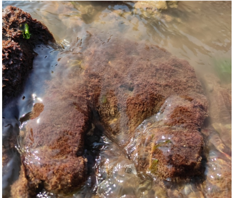
Fig: 2 Gelidium crinale cover with epiphytic microalgae Erythotrichia carnea

This study carried out during September 2020 to march 2021 month. In random sampling method epiphytic microalgae associated with three host marine macroalgae.