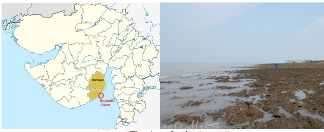
Fig: 1 study site

Study carried out at Gopnath coast part of Bhavnagar district, Gujarat, INDIA. It is come between N 21° 14' 52.4436", E 72° 4' 20.8272", 75 km far from Bhavnagar city. Majority of the coast is rocky.