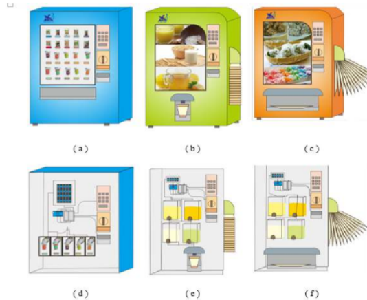
Figure 2. Electrical design of vending machine