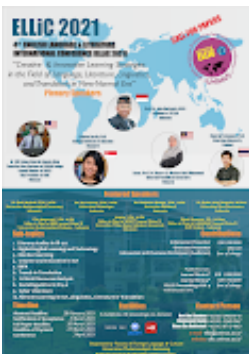
ELLiC 2021 Flyer.png 5946K