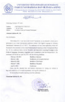
Invitation Letter.jpg 935K